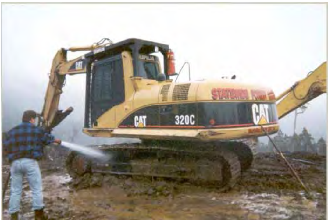
Figure 2 Washing down

Mark or record washdown sites with the landowner or manager for subsequent monitoring and weed control.