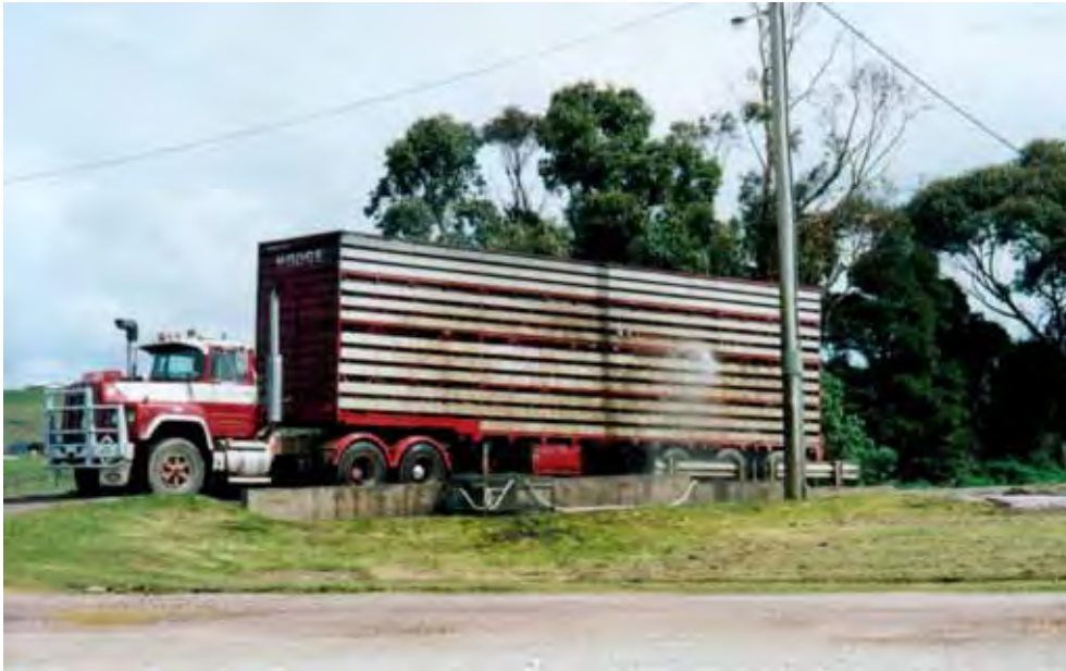
Figure 1 Smithton truckwash in action

Purpose built wash bays should be used when ever possible. These washdown facilities include effective effluent management systems to protect the environment. Commercial washdown facilities are available for vehicles and small trucks at most large towns.